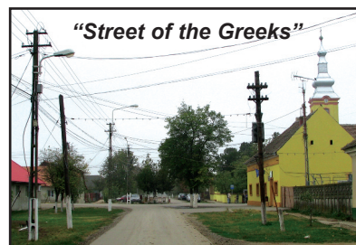
"Street of the Greeks"

Pădureni commune is one of the few settlements in Timiș county whose inhabitants are descendants of a mixture between the Romanian native inhabitants and the Ottoman conquerors of Banat in XVI th -XVII th centuries. Thus, at the end of the Ottoman rule, in Lighed (the medieval name of Pădureni settlement), Romanian and Ottoman inhabitants created a new settlement in Lunca Timișului. Even today you can still find numerous Turkish family names in Pădureni such as: Bechir, Dervis, Lengher or Turcan; the commune grazing ground bears a Turkish name as well: Ali bei, as well as other places in the area of the village such as Vadu' Turcului and Câmpu' Tătarului. The Romanization (and Christianization) of the