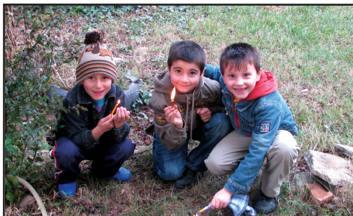
Three children in the yard of the Romanian Orthodox church - Pădureni, October 2009