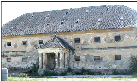
"The granary", historical monument, XIX th century, Giera no. 91. He had a capacity of 700 tones.